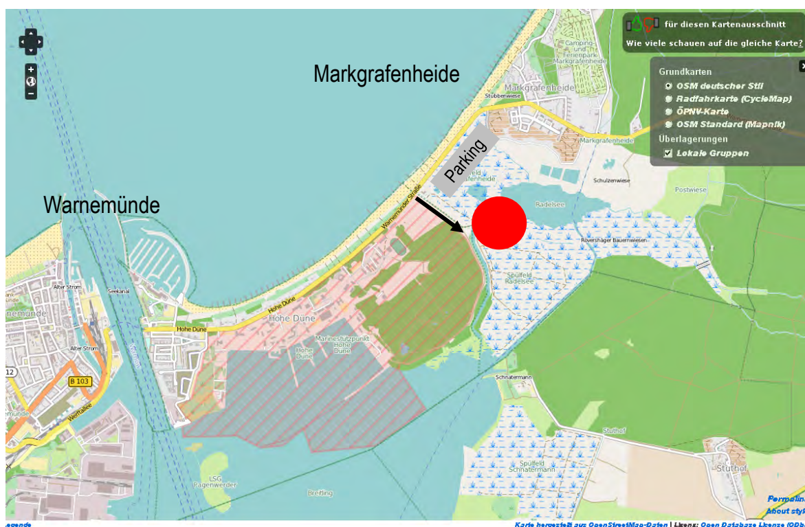
Map of Warnemünde and Markgrafeneheide showing the test site location